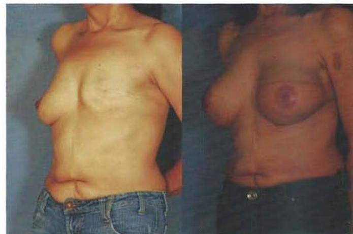
Figure 2. 42 year old female with history of left mastectomy and radiation with left Latissimus Dorsi flap and implant reconstruction.