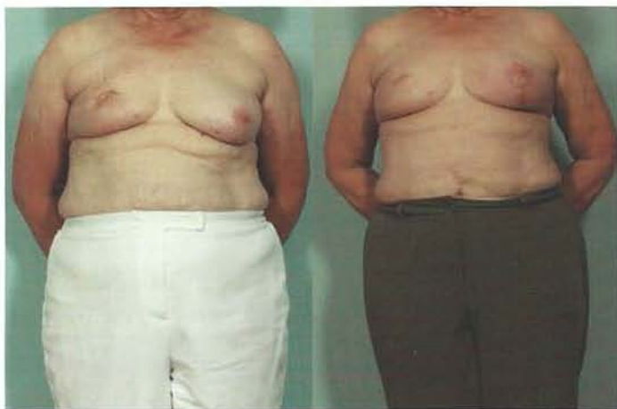
Figure 4. 65 year old female with left breast cancer after lumpectomy and radiation, which underwent right breast fat injections and contralateral breast lift.

Fat injection procedures have become ideal to reconstruct partial mastectomy defects with or without radiation and to mold the reconstructed breast for better symmetry. A clear advantage is decreased recovery time and complications. On the other hand, more than one session may be necessary to achieve optimal goals.