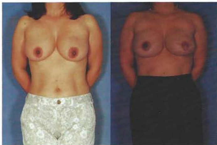
Figure 1. Patient with left breast cancer undergoing immediate reconstruction after skin and nipple sparing mastectomies with implants.

In this technique, an implant or tissue expander can also be utilized. The combined latissimus dorsi flap with breast implant is a good option in obese patients in whom TRAM or free flap procedures are not safe to perform and in thin patients who are not candidates for TRAM flap because of inadequate tissue for reconstruction or closure of donor site. 2 The skin island that is included with this technique can replace any resected skin including nipple-areolar complex to retain the initial shape of the breast skin envelope. The volume of the breast is often achieved with an implant or expander. Thus, it creates a more natural and ptotic-appearing breast. 2 Another advantage opposed to tissue expansion, a second surgical procedure is not always required. Unfortunately, disadvantages include a longer recovery period (4 weeks), atrophy of the latissimus muscle over time making the underlying implant more prominent and surface thickness irregularities. 2